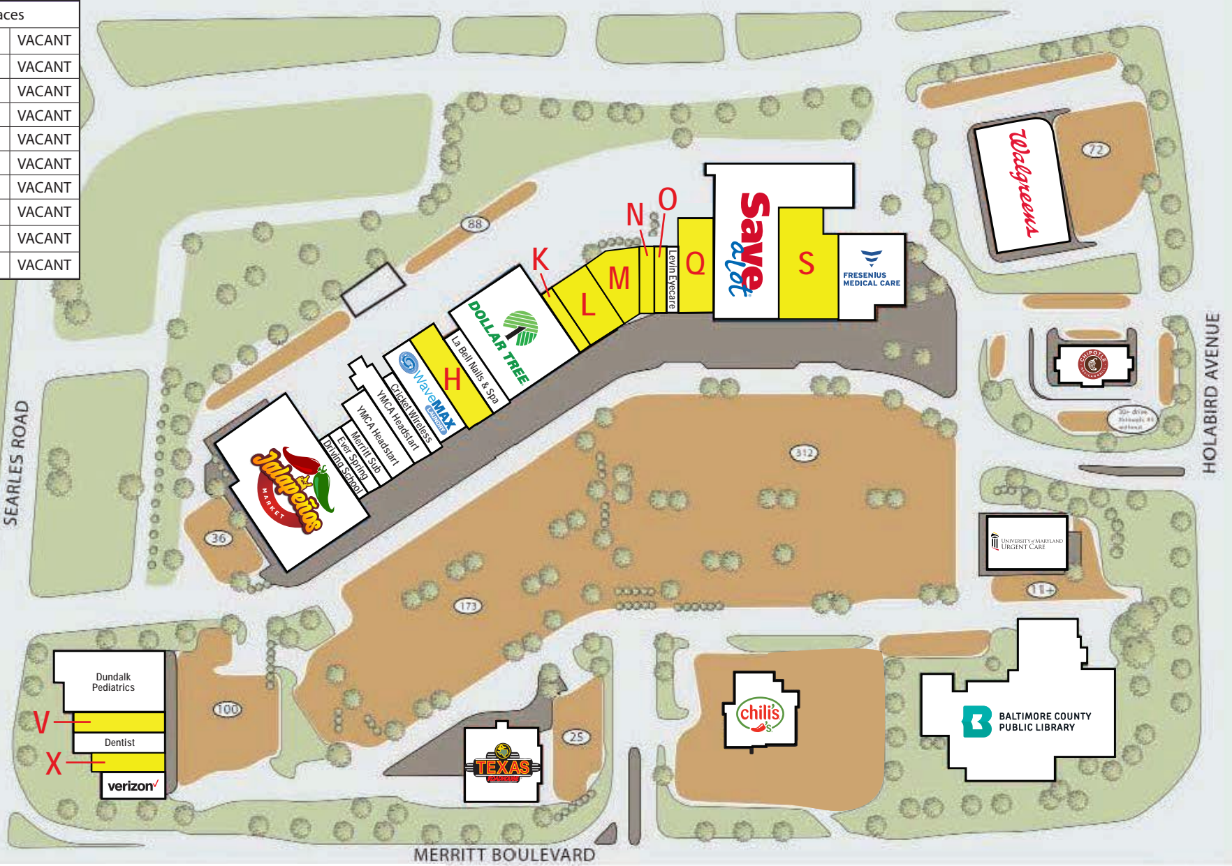
This site plan is for illustrative purposes only. It is not to scale.